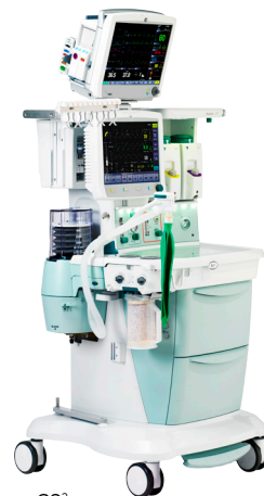
Avance CS 2

Note: Preference for course placement will be given to contract customers. All prices in AUD and exclude GST.